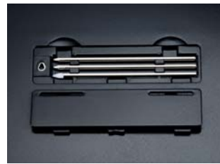
Two Replacement Ink Cartridges and One Plastic Pen Tip in the Cartridge Compartment